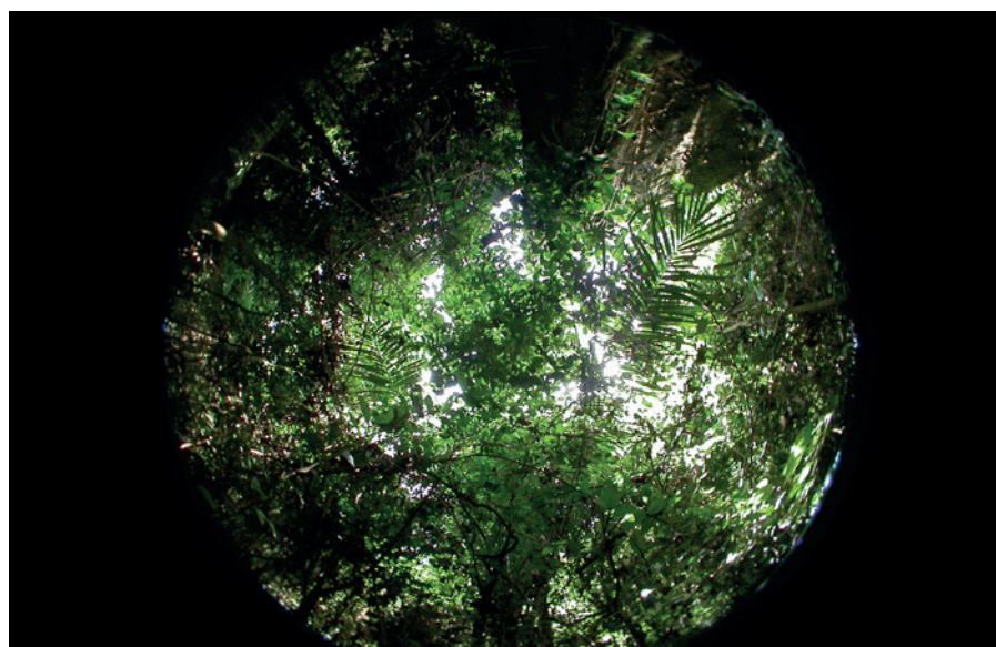
Hemispherical photograph of the tree canopy at a tropical rain forest site in Ghana. Here, and probably in many such ecosystems, the standard satellite data products underestimate the density of the tree cover (used by models to calculate primary production) because there is 100% cloud cover every day.

The magnitude of the CO 2 fertilization effect on terrestrial photosynthesis is uncertain because it is not directly observed and is subject to confounding effects of climatic variability. Professor Colin Prentice and colleagues applied three well-established eco-evolutionary optimality theories of gas exchange and photosynthesis, constraining the main processes of CO 2 fertilization using measurable variables. Using this framework, they provided robust observationally inferred evidence that a strong CO 2 fertilization effect was detectable in globally distributed eddy covariance networks. Applying their method to upscale photosynthesis globally, they found that the magnitude of the CO 2 fertilization effect was comparable to its in situ counterpart but highlighted the potential for substantial underestimation of this effect in tropical forests for many reflectance-based satellite photosynthesis products.