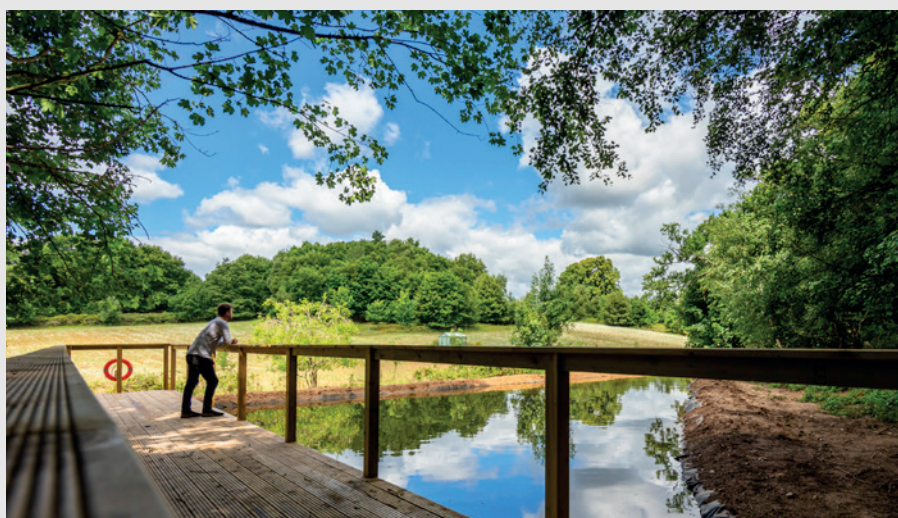
Silwood Park Campus

experiment has been a key resource to form a new generation of scientists, through undergraduate and graduate courses and student final research projects. In 2022 alone, three of the six scientific publications that resulted from work in Silwood Park field experiments studied the Nash's Field plots, showing the continued relevance of the experiment today.