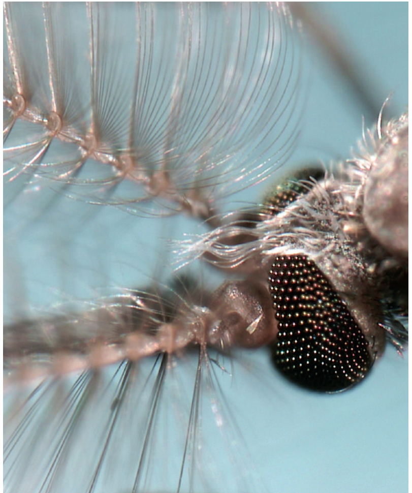
Close-up of an Anopheles mosquito