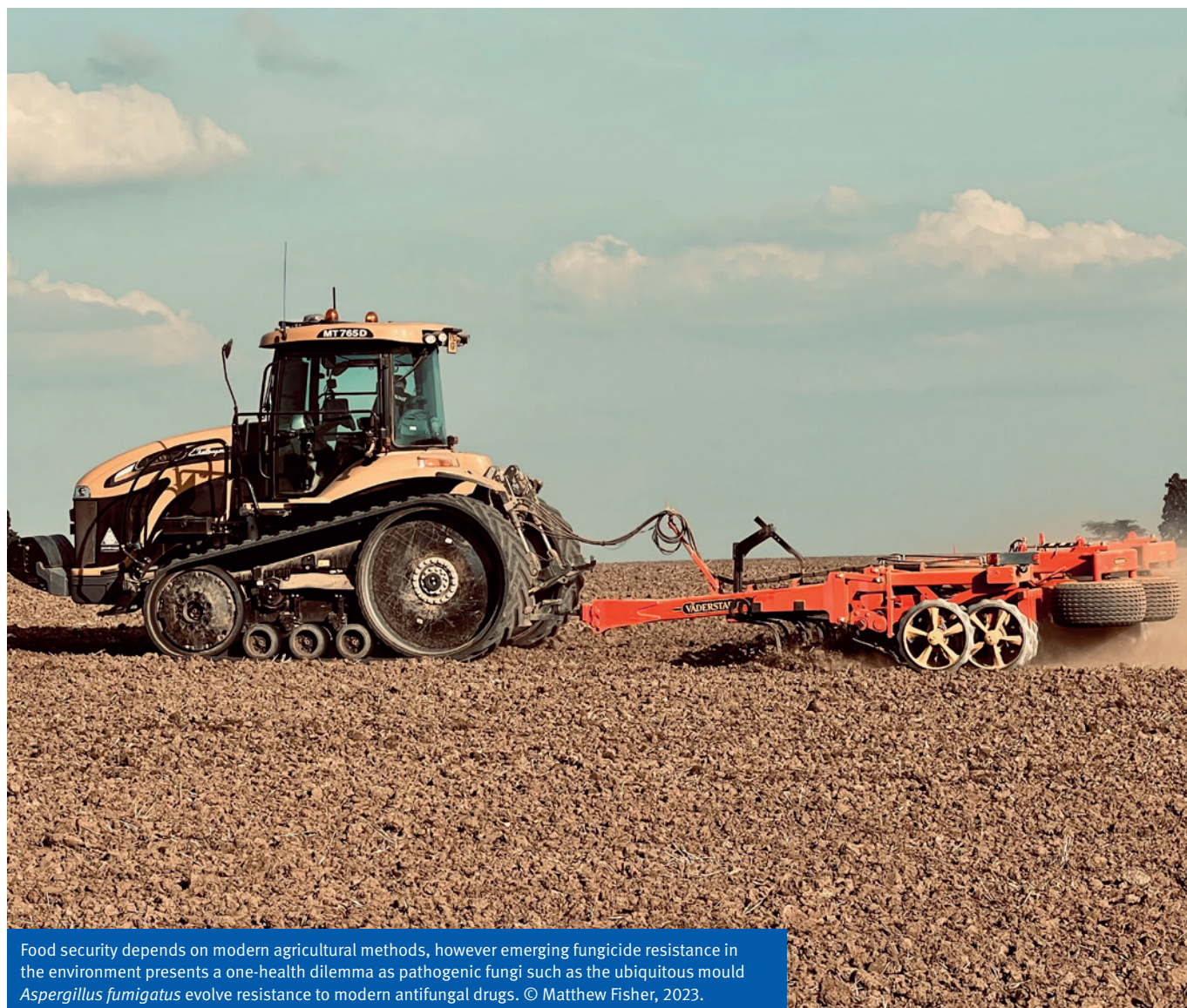
Food security depends on modern agricultural methods, however emerging fungicide resistance in the environment presents a one-health dilemma as pathogenic fungi such as the ubiquitous mould Aspergillus fumigatus evolve resistance to modern antifungal drugs.