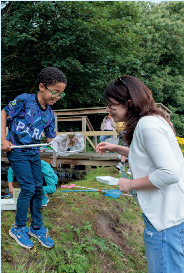
The annual Bugs, Birds and Beasts Day returned to Imperial's Silwood Park campus on 25 July.